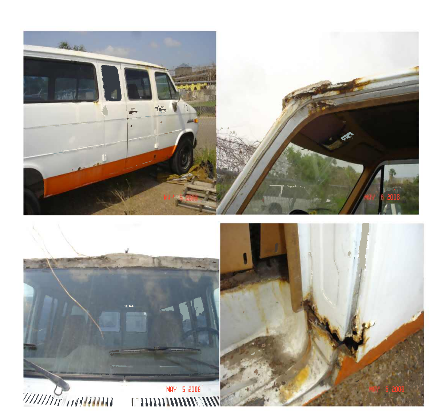
#7 - 1990 cargo van asset # 26444 – Vehicle body has heavy rust, leaks inside, age.